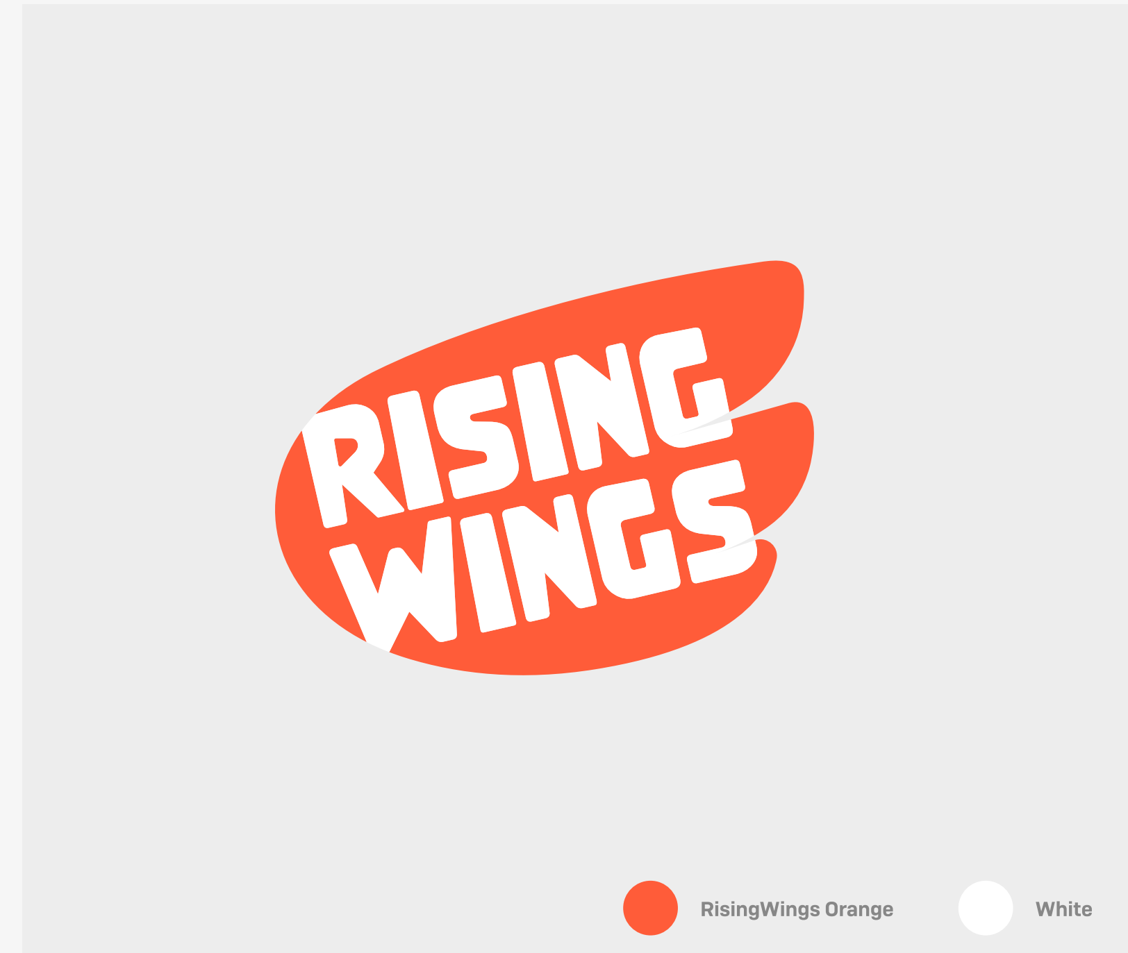
Two Colors Logo(Primary)