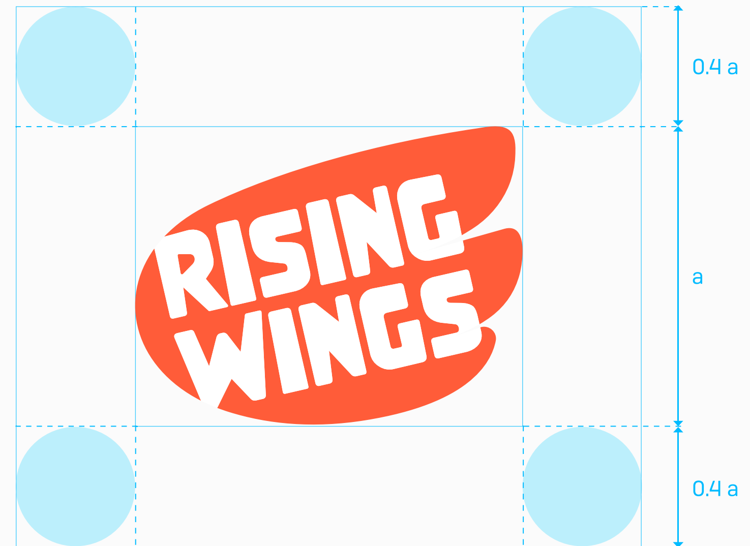
Primary Logo Clear Space

The minimum space rules for the primary logo are as follows.